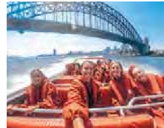
Get the best view of the city from a harbour jet boat tour, Sydney @max_homer

SEE FULL TRIP DETAILS AT CONTIKI.COM/ULTIMATE-AUSTRALIA