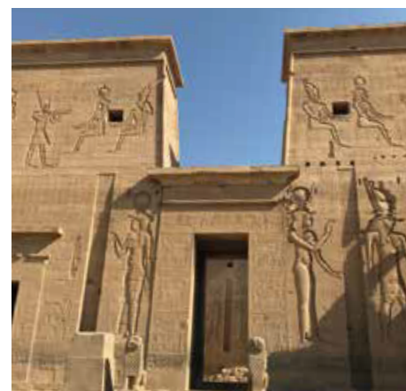
@ULLA, PHILOE TEMPLE