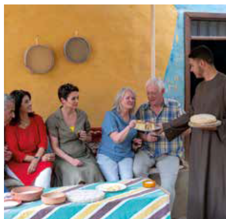
EGYPTIAN SUN BREAD, LUXOR