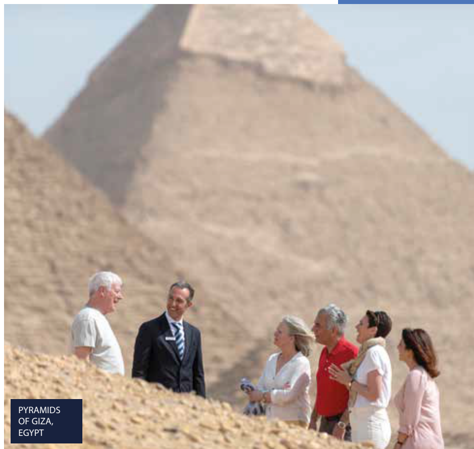
PYRAMIDS OF GIZA, EGYPT