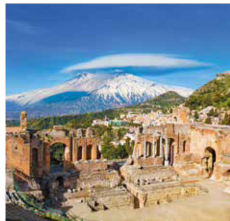
THE GREEK THEATRE, TAORMINA