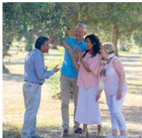
OLIVE TREES, SICILY