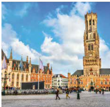
MARKET SQUARE, BRUGES