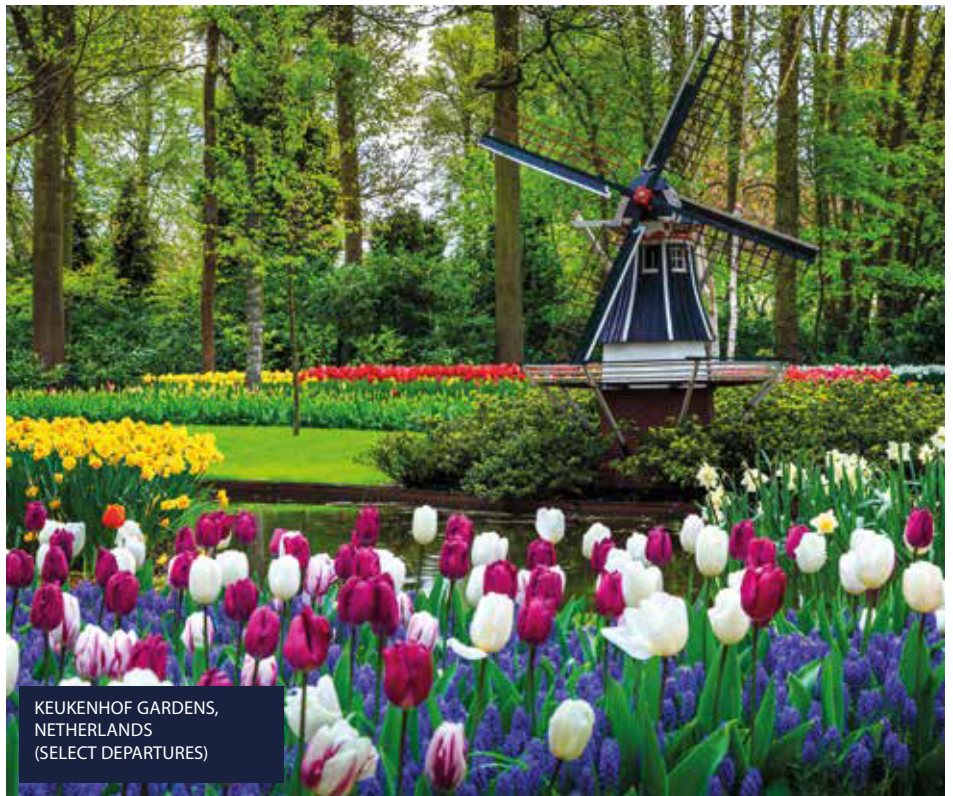
KEUKENHOF GARDENS, NETHERLANDS (SELECT DEPARTURES)