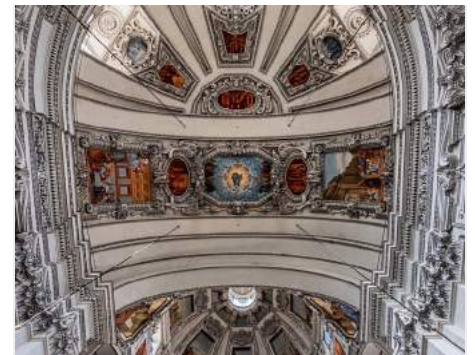
TOP RATED HIGHLIGHT | Have your Local Expert show you the immense Salzburg Cathedral. (Day 5, Salzburg)