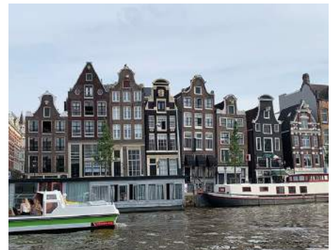
TOP RATED HIGHLIGHT | Cruise in a glass-topped boat through the historic waterways. (Photo by @Chantal_insight, Day 1, Amsterdam)

Bid farewell to the glories of Italy. Departure transfers arrive at Rome's Fiumicino Leonardo da Vinci Airport at 07:00 and 09:30. (B)