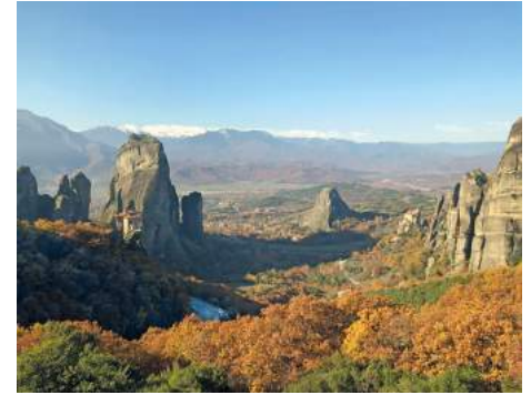
TOP RATED HIGHLIGHT | Visit the towering rocks of Meteora with your Local Expert. (Day 3, Meteora)

Relaxed Start. This morning after breakfast, your Grecian odyssey comes to an end. Take a complimentary transfer to Athens Airport for your onward journey. (B)