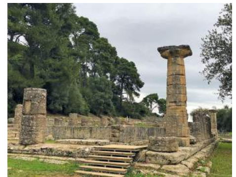
TOP RATED HIGHLIGHT | See the remains of the Temple of Zeus. (Photo by @Caseyneale, Day 5, Olympia)