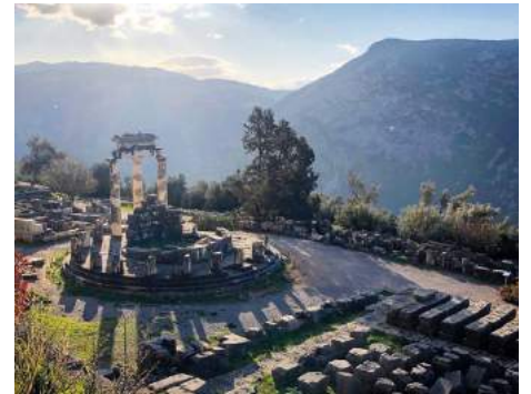
TOP RATED HIGHLIGHT | Walk The Sacred Way and see the Temple of Pronea with your Local Expert. (Photo by @ErinTDGreece, Day 4, Delphi)