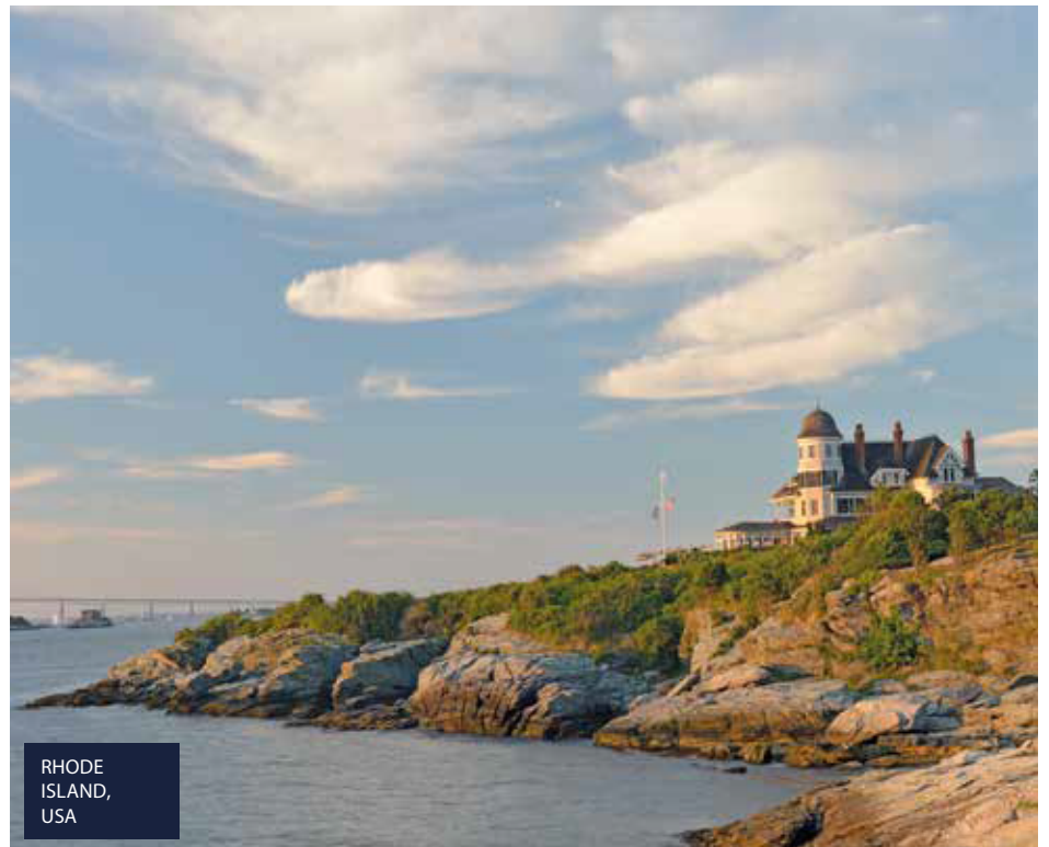
RHODE ISLAND, USA