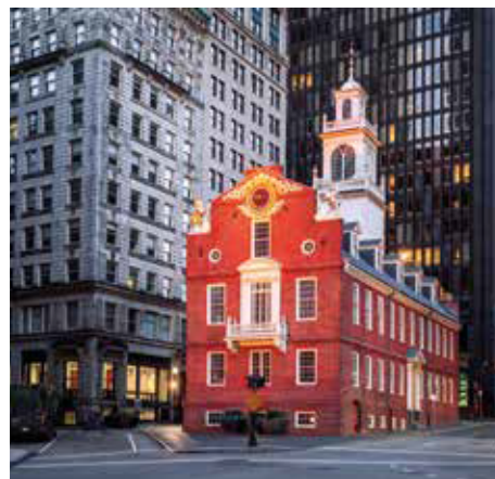
OLD STATE HOUSE, BOSTON